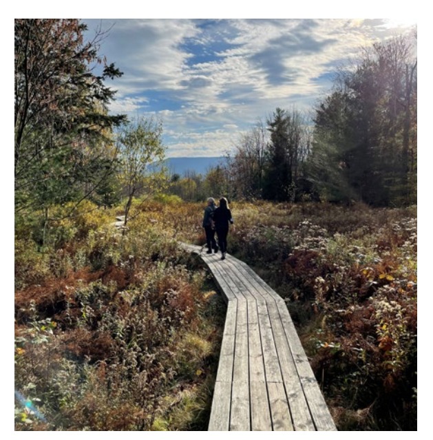
East Meadow Boardwalk