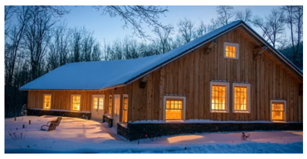
Education Center

In the late summer of 2018, the Mountain Top Arboretum held its first program in its extraordinary timber-frame Education Center, built from twenty-one iconic tree species that are native to the Catskill region and harvested from the Arboretum's site. The building, a visionary achievement of the Board under the leadership of Larry McCaffrey, opened up new possibilities for programming and community outreach, aspirations reinforced