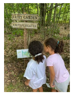
Story Walk program

We believe the best way to appreciate the Mountain Top Arboretum is to understand it. The Arboretum's scientific origins, model gardens, and exceptional natural features offer myriad opportunities for educational programming, and our iconic new Education Center and outdoor classroom position us to be a leader in Catskill ecosystem education. Therefore, it is our job to interpret, explain, and engage audiences and visitors of all ages, backgrounds, and abilities through knowledge-sharing and hands-on activities.