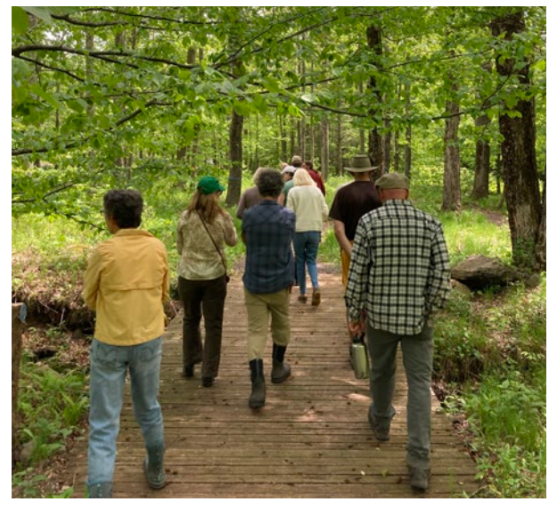
Native Tree Trail tour photo by Cookie Brindle

Our plan captures what we do best and identifies what more we can do given the right conditions and resources. Excellent stewardship – of our land, our community, our region, and our organization – is our highest priority as we cultivate our future.