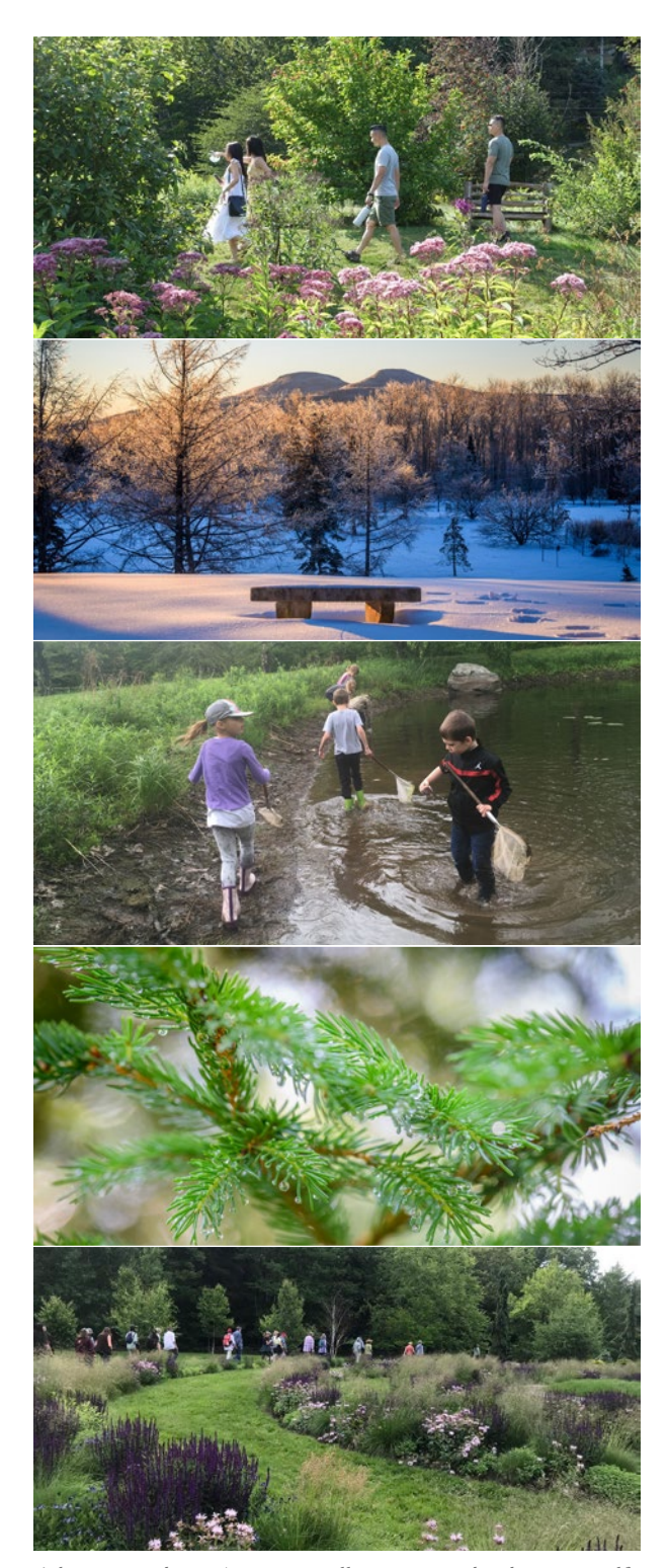
(Photos top to bottom) Visitors stroll in West Meadow. Winter view of West Meadow. School Field Trip. Red Spruce. Bird Watching program.