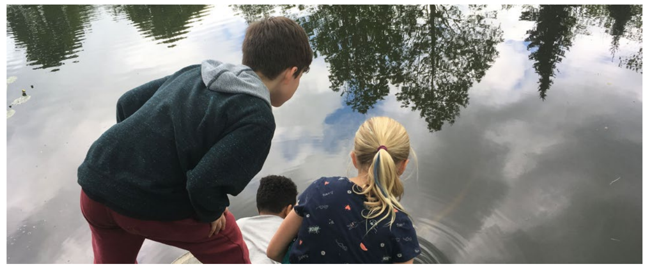
(Above) School Field Trip (Next page) Winter view of West Meadow