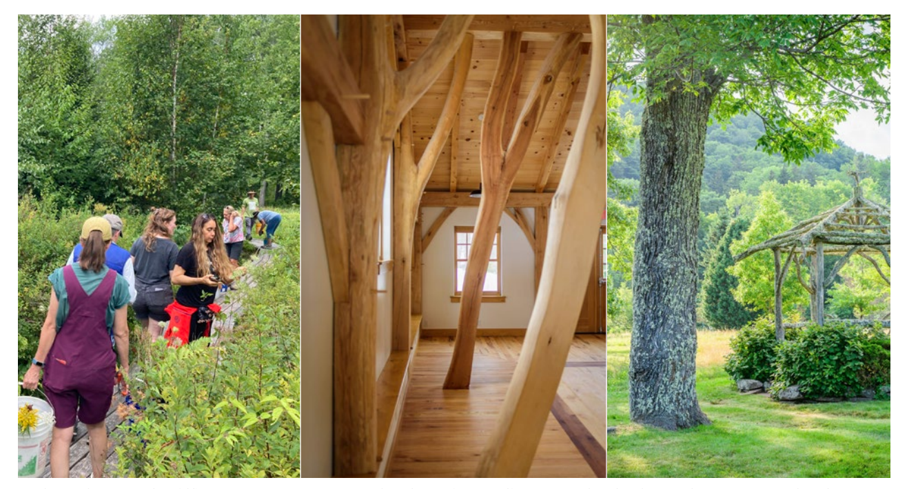
(Left to right) Foraged Wildflower Arrangements program photo by Cookie Brindle, Interior of timber frame Education Center photo by Rob Cardillo, West Meadow White Ash and Gazebo photo by Rob Cardillo.

Our plan responds to challenges and opportunities and inspires us to act on them while maintaining our highest standards of excellence.