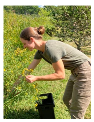
Wildflower program

Horticulture is at the heart of our Arboretum. We strive to create and support a landscape that is dynamic and experientially rich, full of beauty layered into a sound ecological approach. Our aesthetic and sensibility evolve along with our