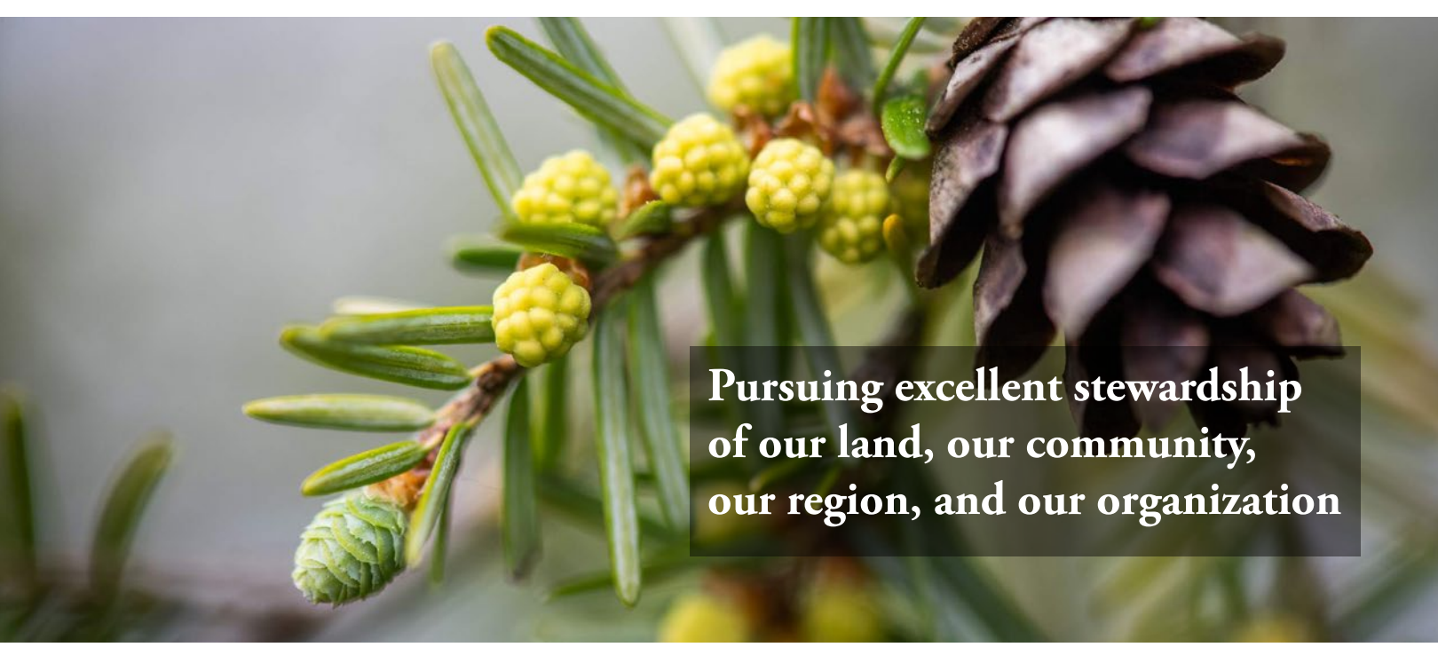
(Above) Eastern Hemlock cones photo by Rob Cardillo. (Below left) Leaf drawing by Thorneater.