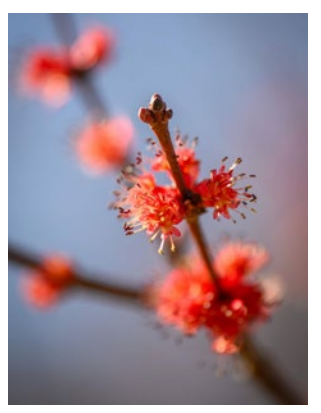
Red Maple flower

an area which includes ecologically important and visually stunning meadows, wetlands and forests. As the Arboretum has grown in size, its commitment to land stewardship has grown as well, both in managing