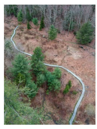
East Meadow Boardwalk

1. Through responsible horticulture practices and aesthetically pleasing design, to educate and inspire visitors to garden sustainably and mindfully of environmental health.