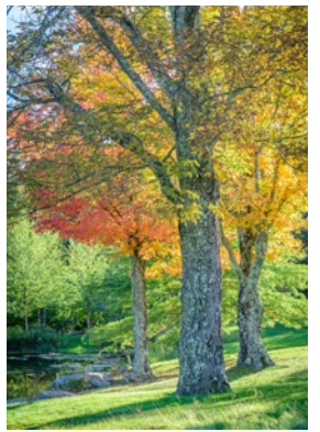
Sugar Maple

The Mountain Top Arboretum enjoys a rare location, and decades of dedicated cultivation and preservation have only served to heighten the beauty and importance of its landscape. Within its 178 acres, the Arboretum has many unique charac-