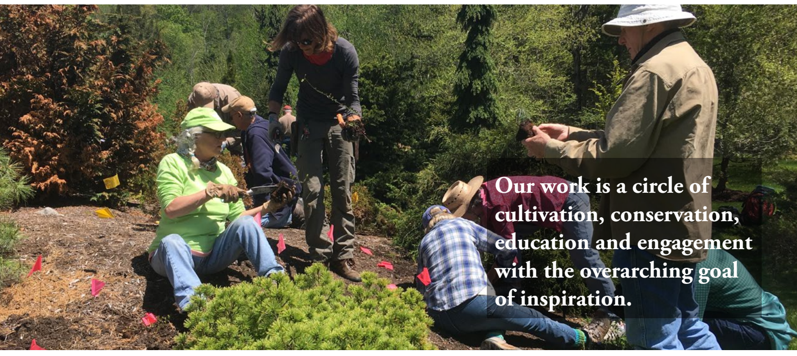
(Above) Volunteers and Staff plant native groundcovers in the Conifer Berms. (Below left) Leaf drawing by Thorneater