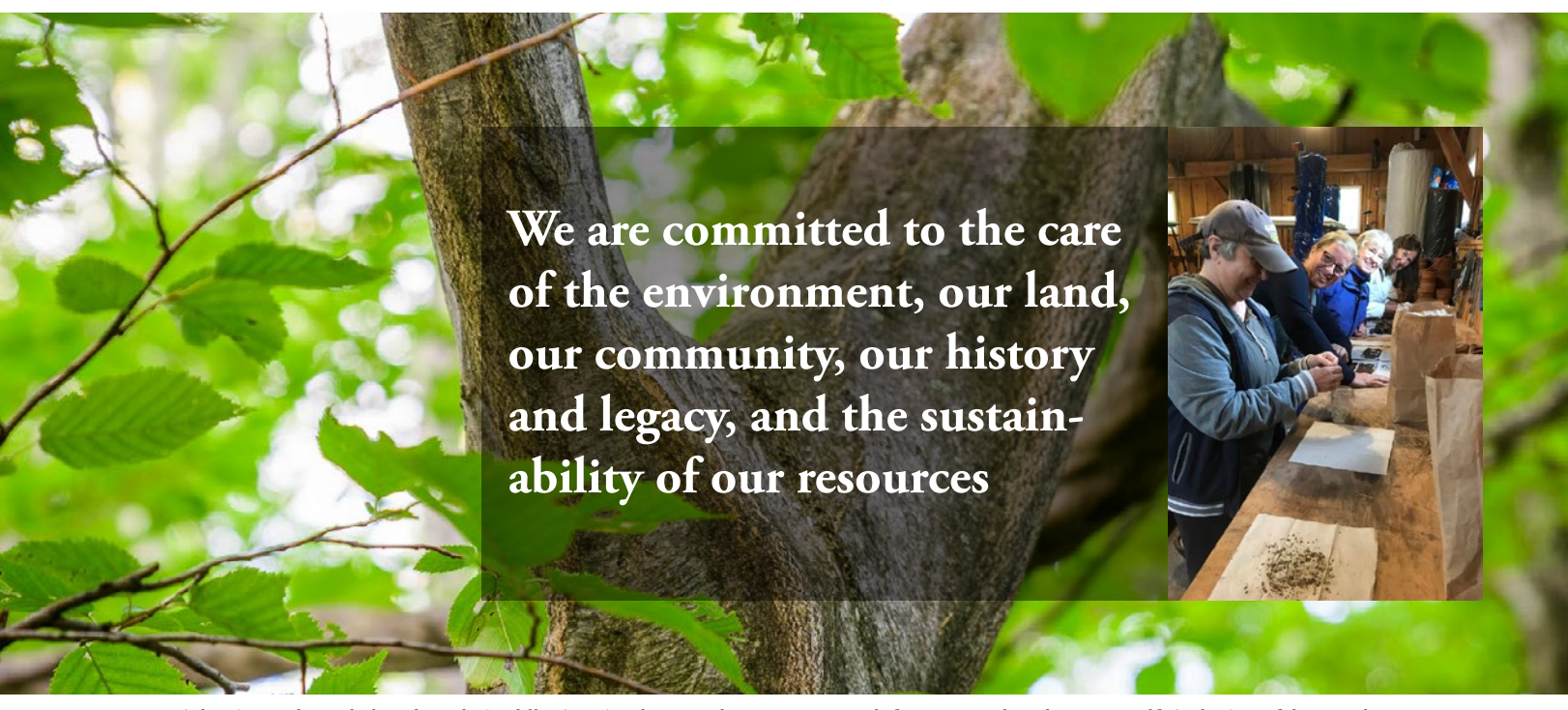
(Above) Musclewood. (Inset) Volunteers cleaning native seeds for sowing. (Below) Leaf drawing by Thorneater.