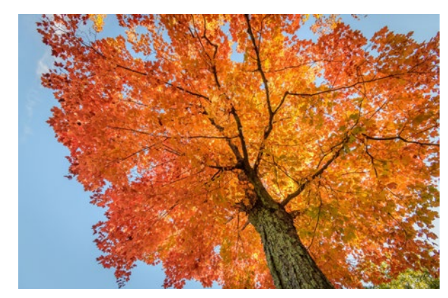
Sugar Maple