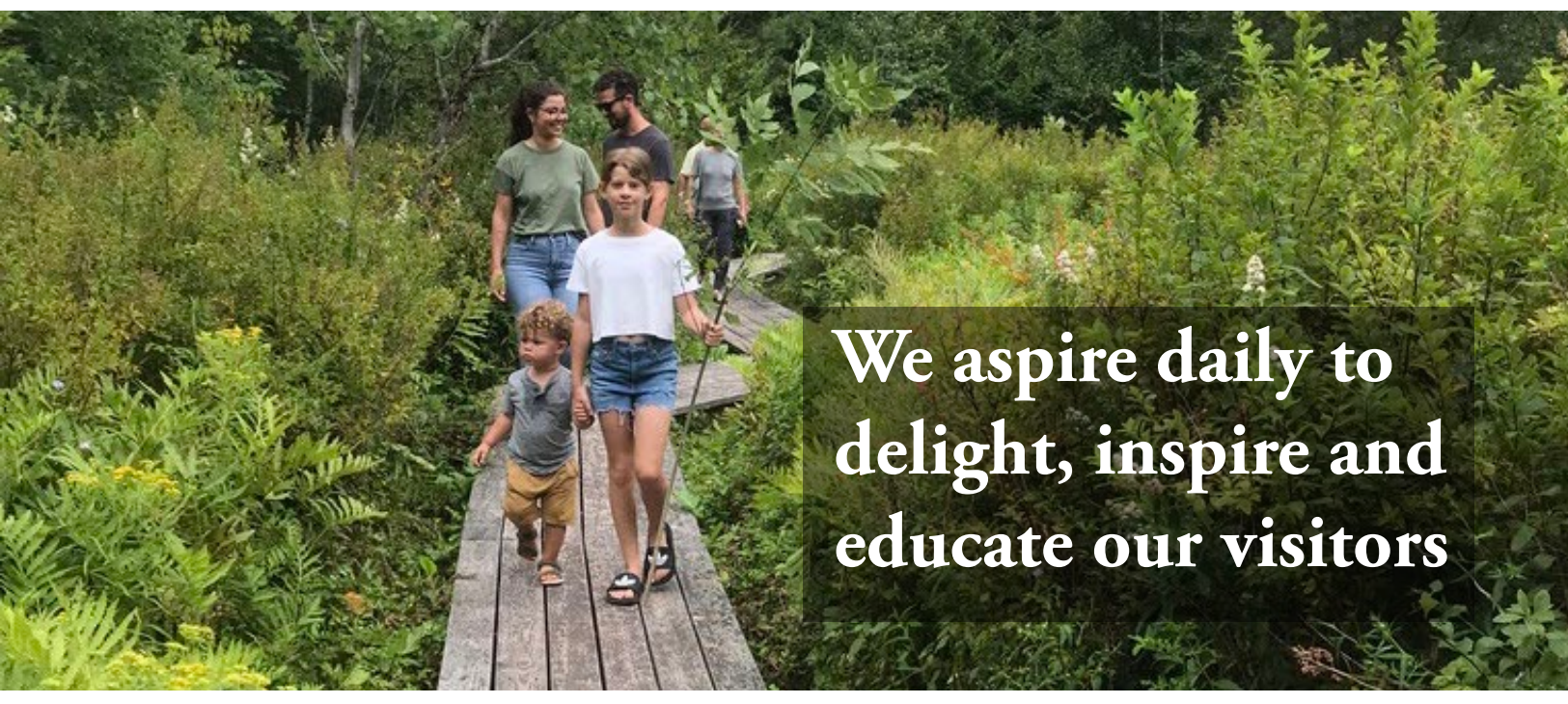
(Cover) Striped maple seeds. (Above) East Meadow Boardwalk. (Below left) Leaf drawing by Thorneater.